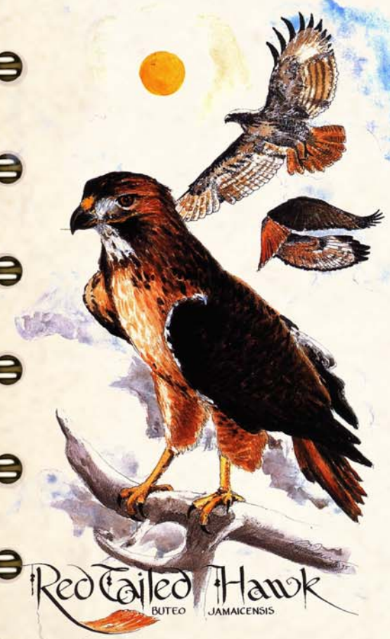
Red-tailed Hawk BUTEO JAMAICENSIS

The Mojave is also the driest North American desert, averaging about 5 inches of rain and snow a year. Snow? Yes, the Mojave features hot summers and cold winters. In winter, night time temperatures frequently fall below freezing. In any month, low and high temperatures may vary by 30 degrees in a day.