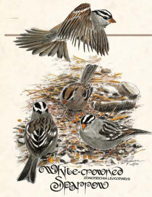
White-crowned Sparrow ZONOTRICHIA LEUCOPHRYS