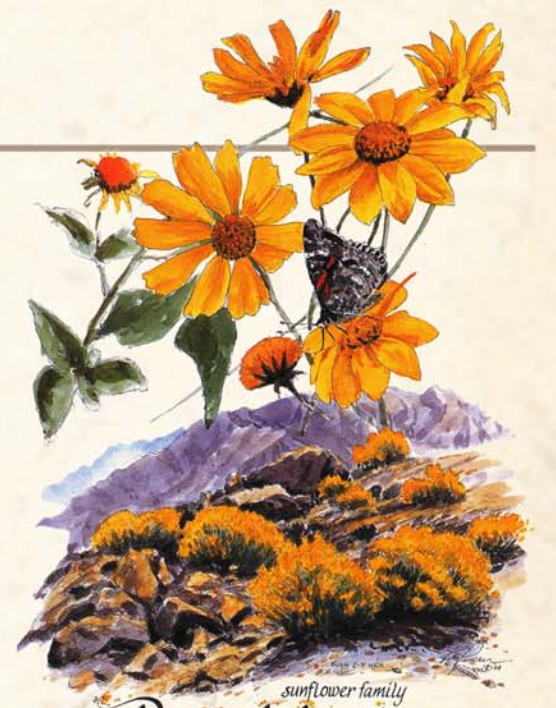
sunflower family Brittlebush ENCELIA FARINOSA

The Mojave is also the driest North American desert, averaging about 5 inches of rain and snow a year. Snow? Yes, the Mojave features hot summers and cold winters. In winter, night time temperatures frequently fall below freezing. In any month, low and high temperatures may vary by 30 degrees in a day.